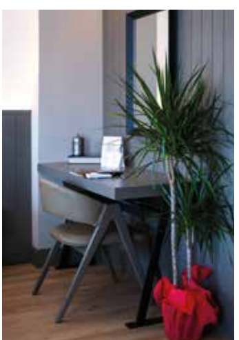
The X Belek Hotel reserves the right to make changes to working hours, as well as the concept, depending on weather conditions and/or the number of guests.