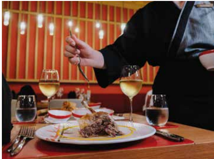
The X Belek Hotel reserves the right to make changes to working hours, as well as the concept, depending on weather conditions and/or the number of guests.