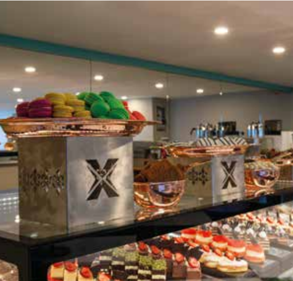
The X Belek Hotel reserves the right to make changes to working hours, as well as the concept, depending on weather conditions and/or the number of guests.